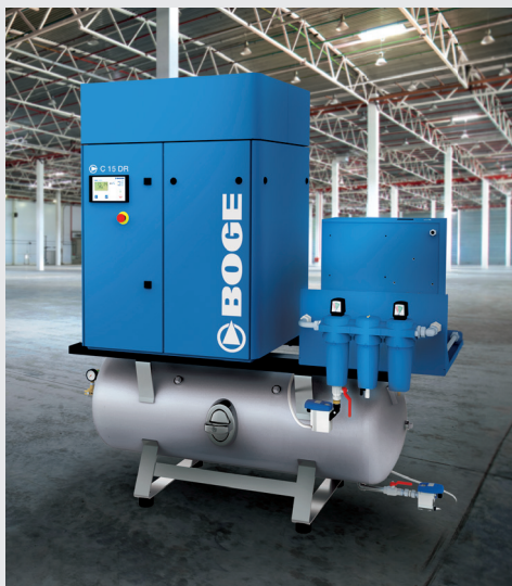
No matter what your main priorities are – the number of options available covers all of your requirements.

The C 15 DR meets your each and every need: in addition to a selection of receiver sizes, you have the option of including a refrigerant dryer, oil/water separator, integrated filters and even an intake air filter. The pre-assembled pipework ensures that both the installation work and the space required are kept to an absolute minimum.