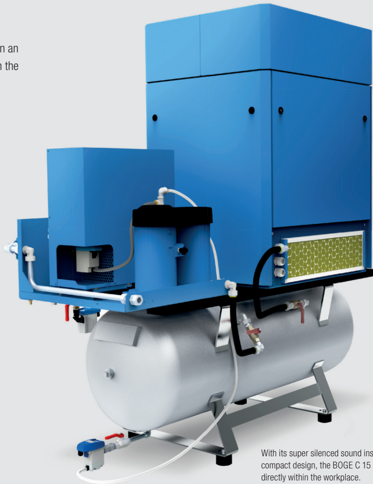
With its super silenced sound insulation and extremely compact design, the BOGE C 15 DR can be installed directly within the workplace.